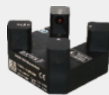
1523 Needle sensor