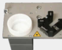
2510 Purging unit